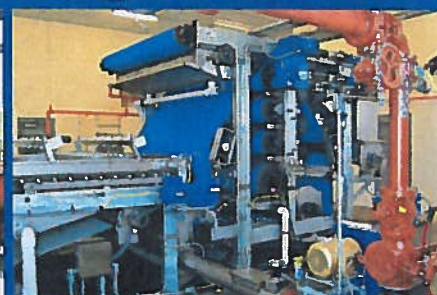
3DP 1.5 m - operate as GBT or Belt Press