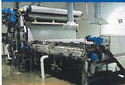
3.0 m Model 3DP - Floor level