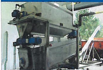
DSP Screw Press Model 3012, NY WWTP